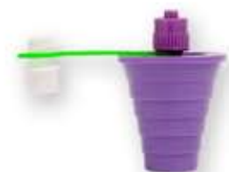
Syringe Bottle Adapter Ref. : 310-20