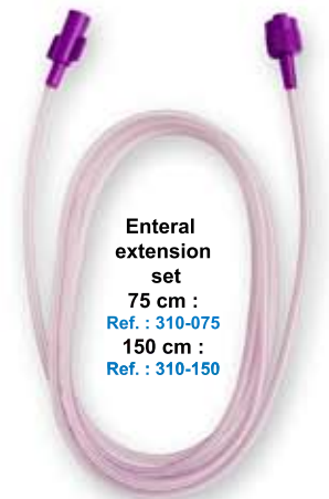
Enteral extension set 75 cm : Ref. : 310-075 150 cm : Ref. : 310-150