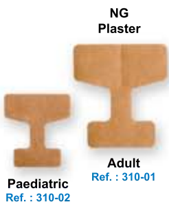
Paediatric Ref. : 310-02