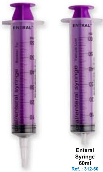
Enteral Syringe 60ml Ref. : 312-60