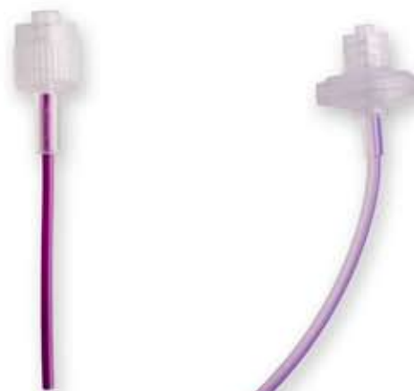
Medicines straw Ref. : 310-06