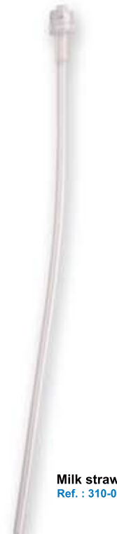
Milk straw Ref. : 310-07